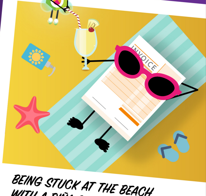
BEING STUCK AT THE BEACH WITH A PIÑA COLADA