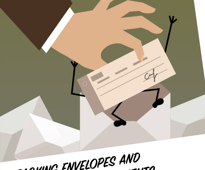
PACKING ENVELOPES AND MAILING VENDOR PAYMENTS