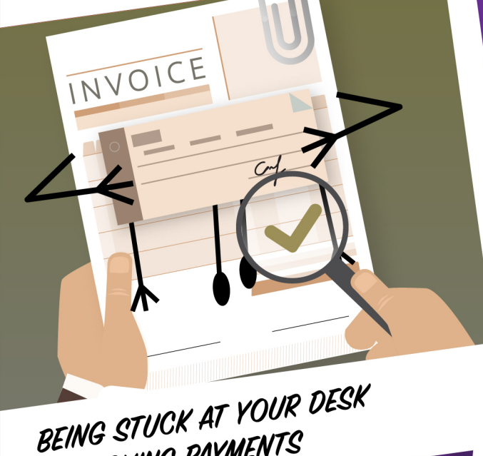
BEING STUCK AT YOUR DESK APPROVING PAYMENTS