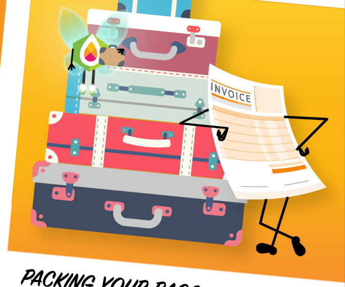
PACKING YOUR BAGS FOR A WEEKEND GETAWAY