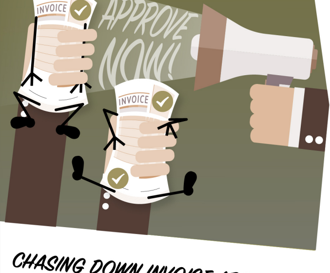
CHASING DOWN INVOICE APPROVERS