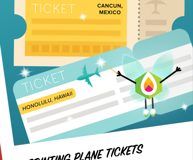
PRINTING PLANE TICKETS