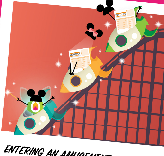
ENTERING AN AMUSEMENT PARK