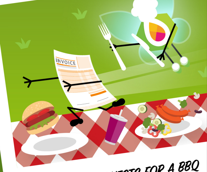
CHASING DOWN GUESTS FOR A BBQ